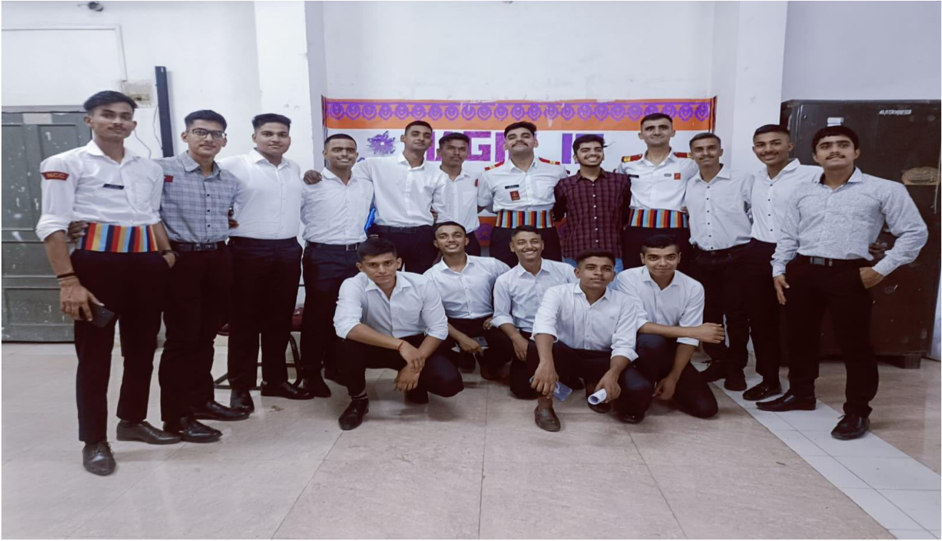
Farewell of Rank Panel (2021-22)