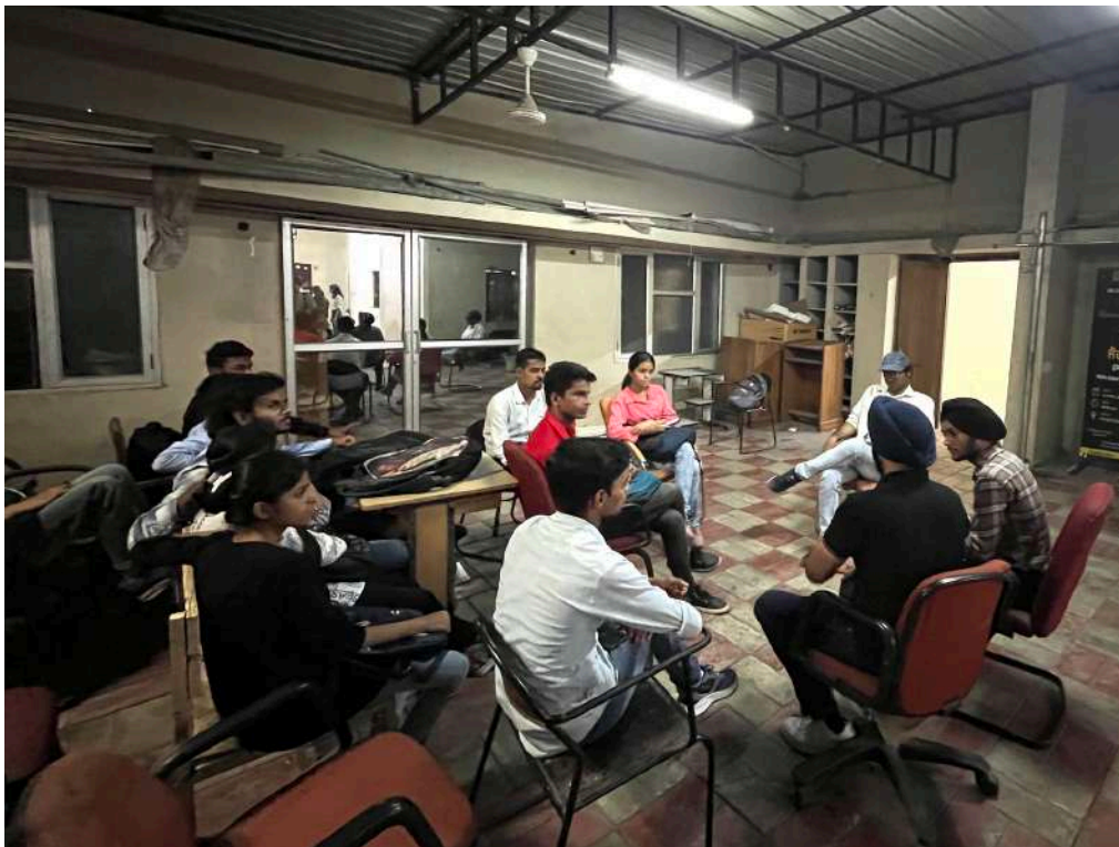
Members of Dance (above) and debating society (below) practicing in the creative hub space for cultural societies