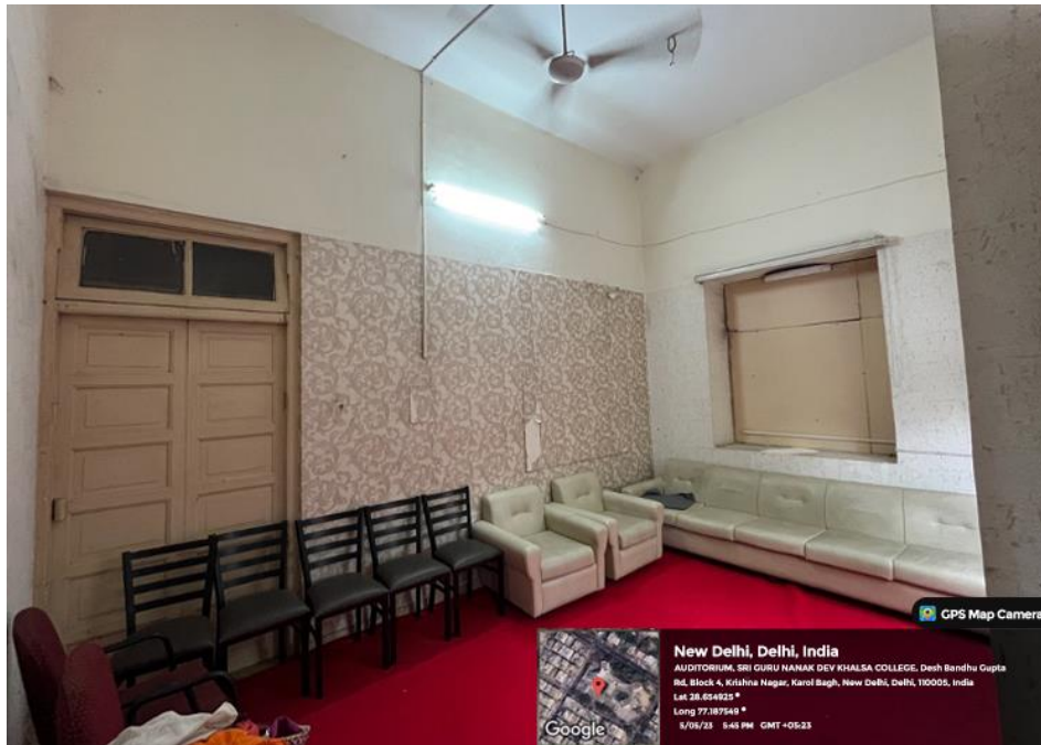
Girls Common Room