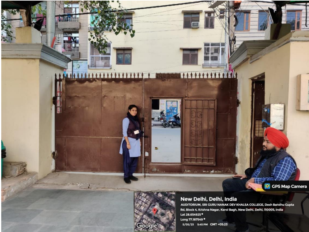
Female Guard at the college gate